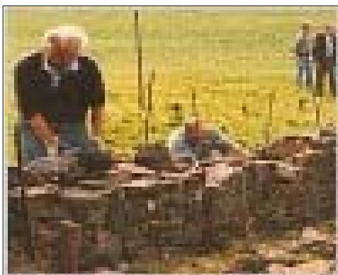
Yorkshire - Standard Wall Construction

The Dry Stone Walling Association of Great Britain is the foremost national organisation involved solely with dry stone walling. Founded in 1968, DSWA has established a highly regarded skills certification scheme, which is nationally accredited and used throughout the world.