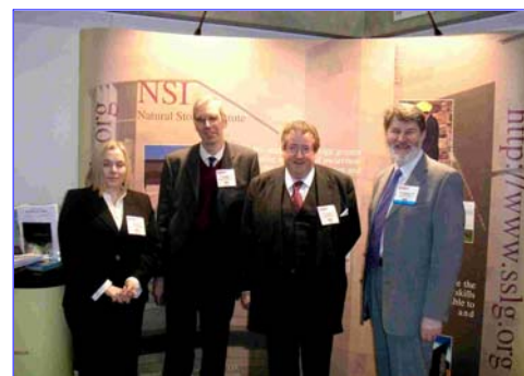
Sir William McAlpine, first President of the Natural Stone Institute

'I fully endorse the aims and objectives of the Natural Stone Institute and am delighted to have this opportunity to make a constructive contribution to its further development. This generation has a responsibility to ensure that our country's built heritage, not just listed buildings, is maintained in the most appropriate manner – that is what the Institute is seeking to achieve and I am looking forward to doing what I can in this respect.'